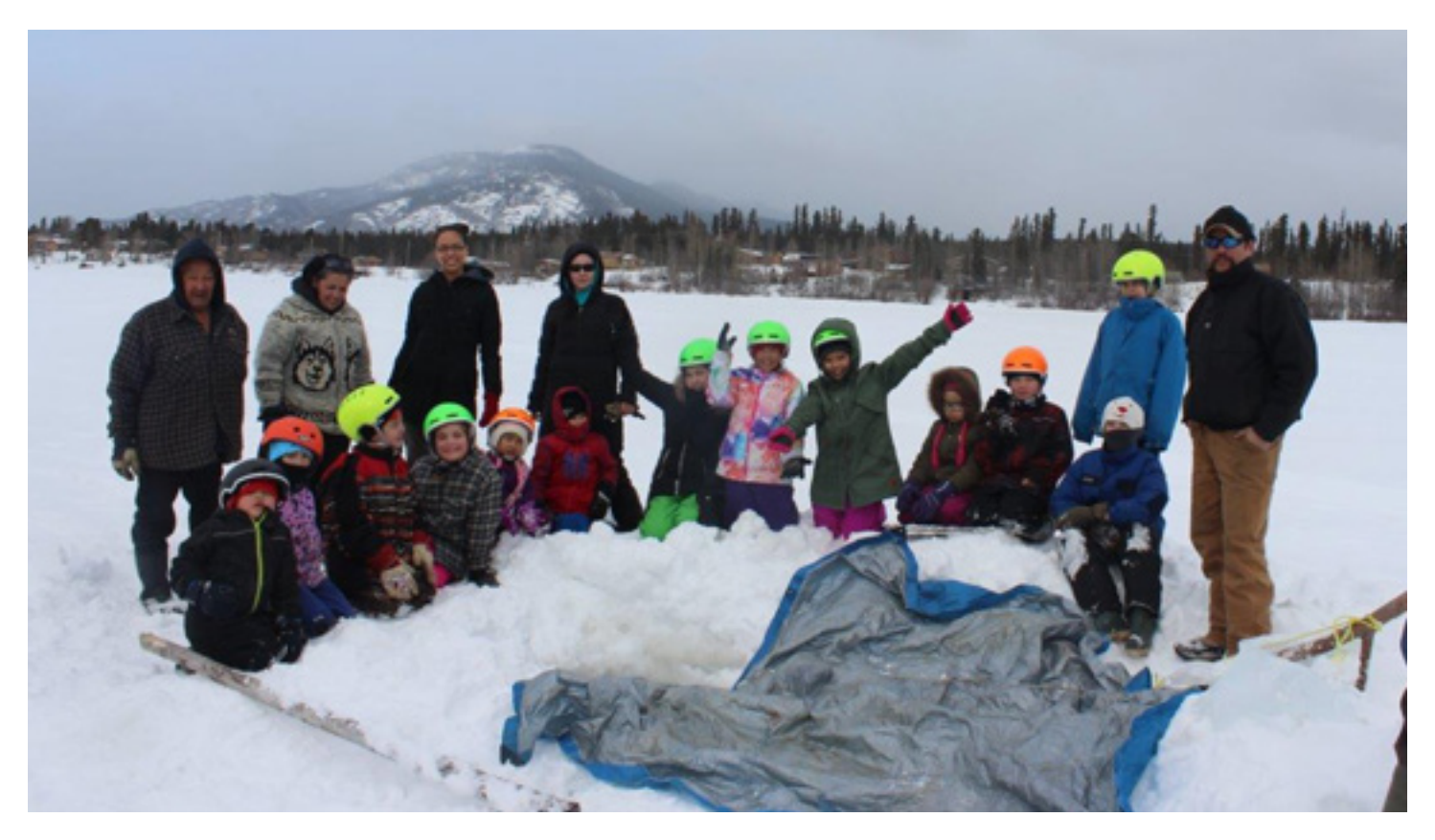
PHOTO: Youth have an exciting time watching the fishnet being pulled.