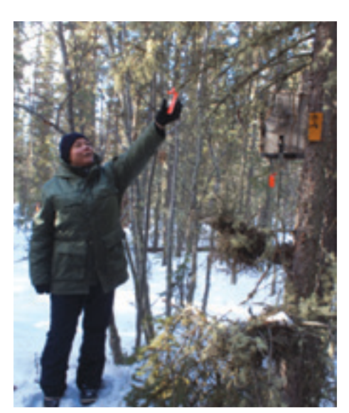
Photos: Participants during the Trapper Training Course hosted by TTC and TRRC