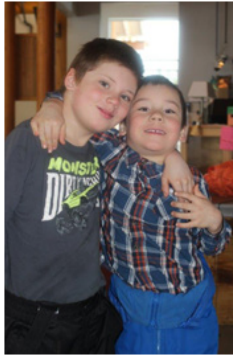
TOP LEFT: Two men learn how to scrape hides. TOP RIGHT: These two brothers are proud to be the first at the heritage to enjoy the day's events.