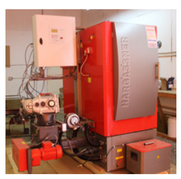
ABOVE\ LEFT:\ Biomass\ Training\ took\ place\ in\ March-there\ was\ plenty\ of\ participants.\ ABOVE\ RIGHT:\ Biomass\ burner.