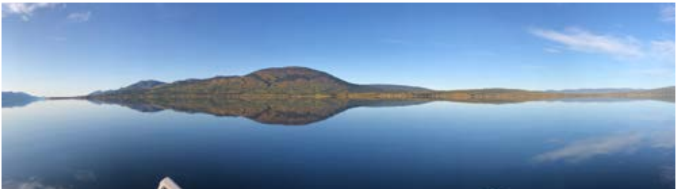
Beautiful Teslin Lake, September 2019.